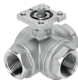
3-way ball valve VZBE