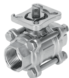
2-way ball valve VZBE