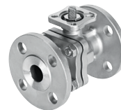
Ball valve VZBF