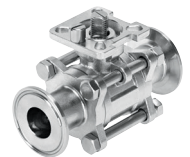
Ball valve VZBD, with clamp ferrule