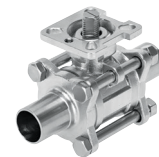
Ball valve VZBD, with long welded ends