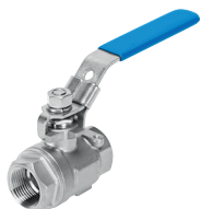
Ball valve VZBE, manual