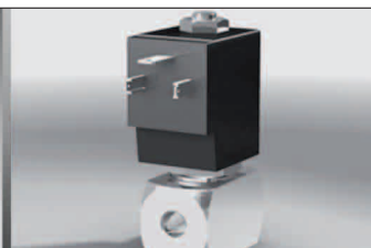
... Small diameters ... sec 1