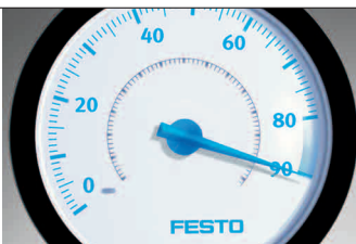
Pressure range 0 to 90 ...